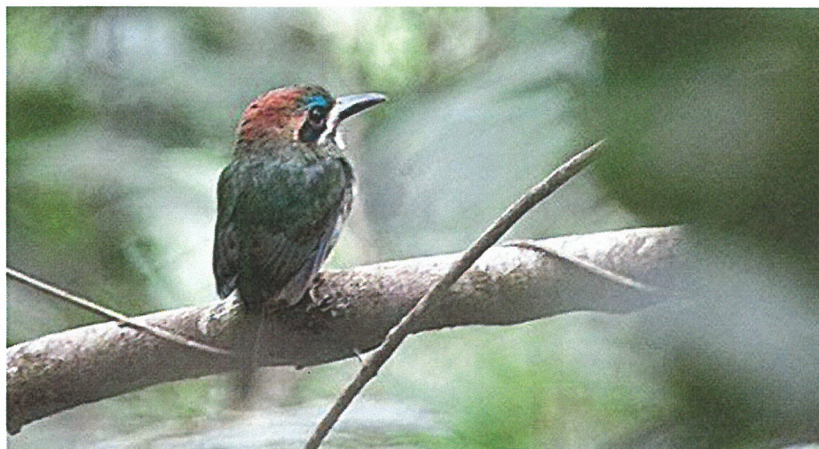
Cana, Darién, Panama; 21 December 2009