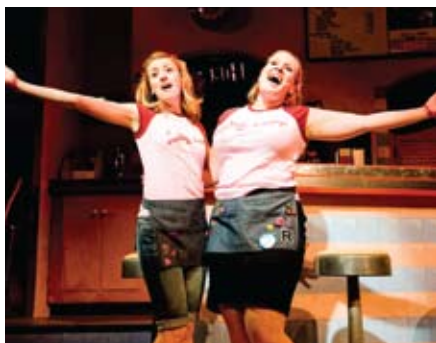
Pump Boys and Dinettes, 2008