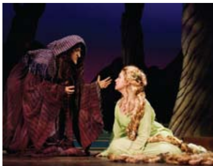
Into the Woods, 2007