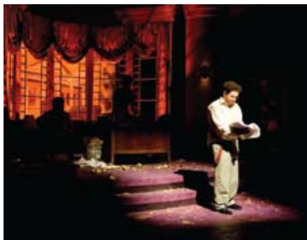
Moonlight and Magnolias, 2008