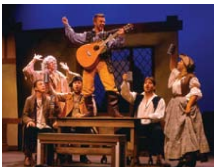
She Stoops to Conquer, 2004