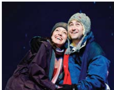
Almost, Maine, 2008