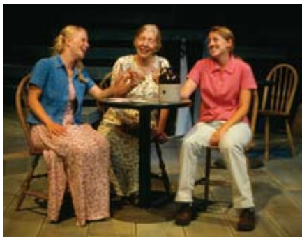
The Spitfire Grill, 2004