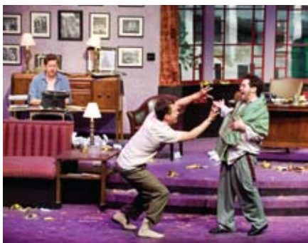
Moonlight and Magnolias, 2008