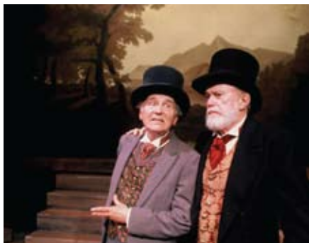
Big River, 2005