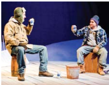
Almost, Maine, 2008