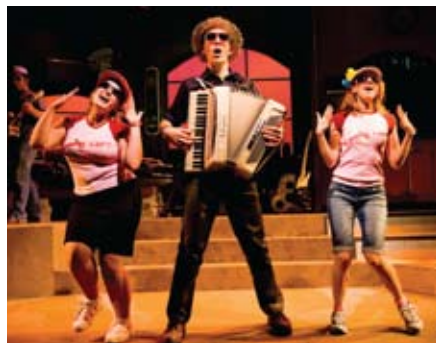
Pump Boys and Dinettes, 2008